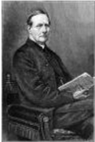
Sabine Baring-Gould (1834-1924)

(1810-1893) was an accomplished and remarkable man. It was he, in 1840, who conceived and created the Whitsuntide procession, marking the anniversary of St. Peter and the founding of local schools. The event began at 1.30 p.m. and involved a great number of people who regularly totalled 700 plus. They consisted of robed clergy, schoolchildren, parents, teachers and local dignitaries.